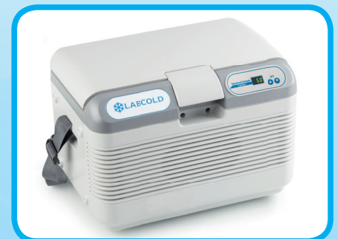
Hygienic easy clean exterior