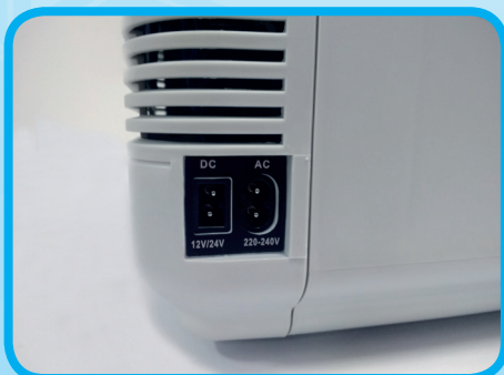
12v and mains power points